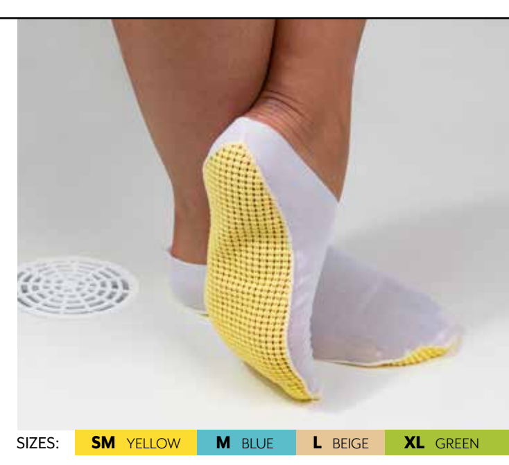
Available in 1, 12, 24 & 48 pairs