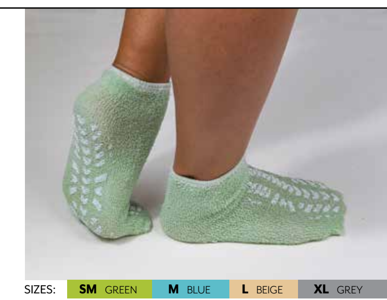
Available in 1, 12, 24 & 48 pairs