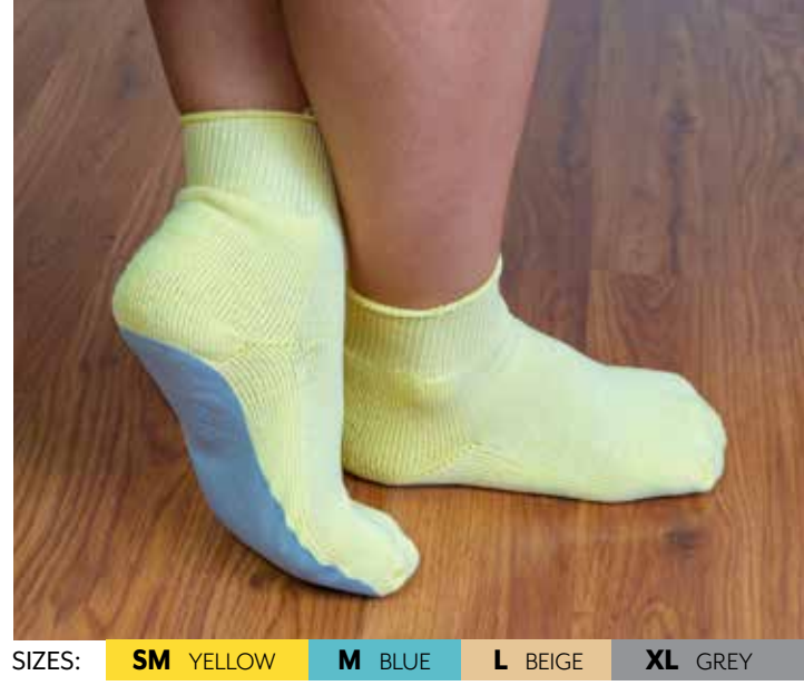
Available in 1, 12, 24 & 48 pairs