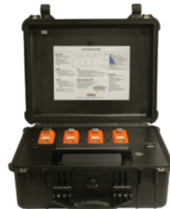
Bump/Cal Test Station (Compatible with CO, H 2 S & O 2 )