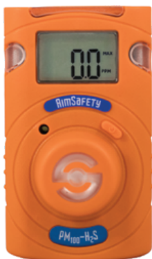
PM100-H 2 S