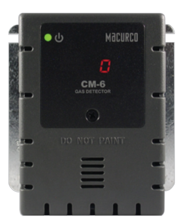
Grey Housing (Standard)