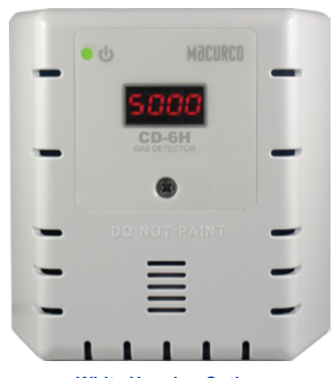
White Housing Option