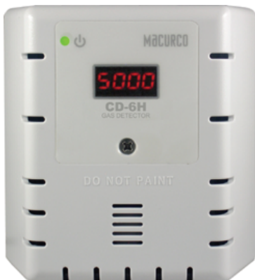
White Housing Option