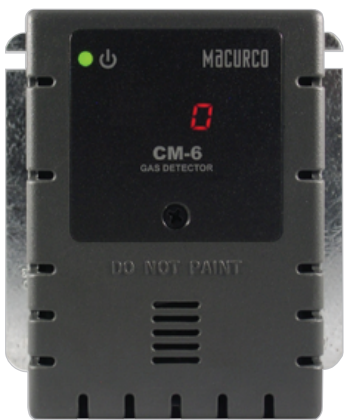
Grey Housing (Standard)

The Macurco 6 & 12 Series fixed gas detectors provide life-saving solutions to protect people and property. These fixed gas detectors are designed for low-level detection, mitigation, and notification. Let these detectors do the work for you by shutting off valves, turning on fans, engaging horns and strobes, and providing notification to fire panels and building automation systems when gases reach vital limits.