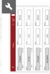
Set analog outputs