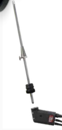
Probe for low dirt applications