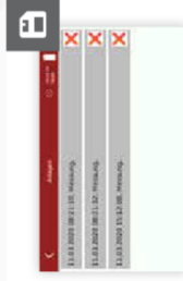
Save measurements by facility