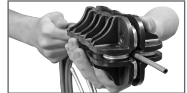
Continue Feeding Tubing Through Working Back & Forth 2- 3x Until Entire Coil is Straight