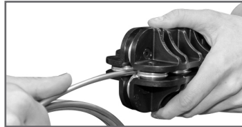
Feed Tubing Through Center Rollers Until It Appears on the Other side