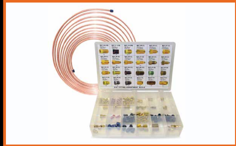
3/16" Kit — BLFA-8K*