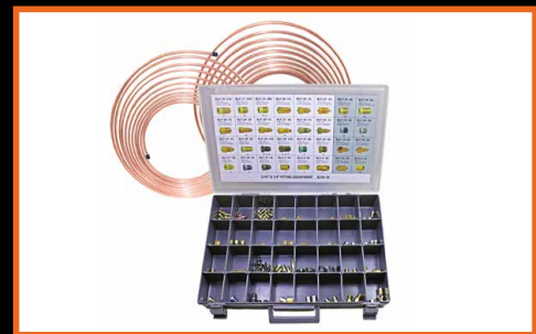
3/16" & 1/4" Kit — BLFA-10K*