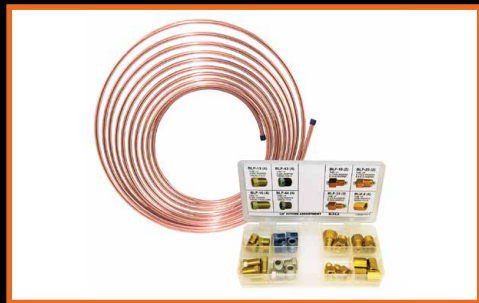
1/4" Kit — BLFA-9K*