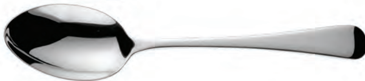
Serving Spoon 25cm