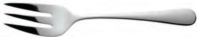
Serving Fork 23cm