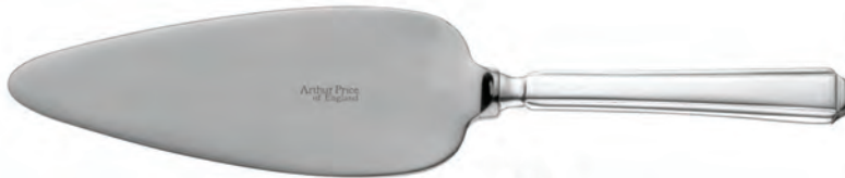
Pie Knife 25.5cm