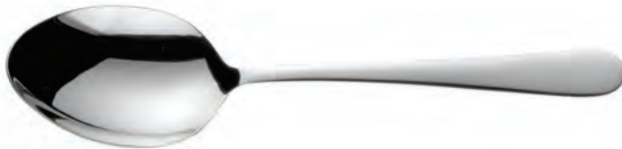
Serving Spoon 23cm