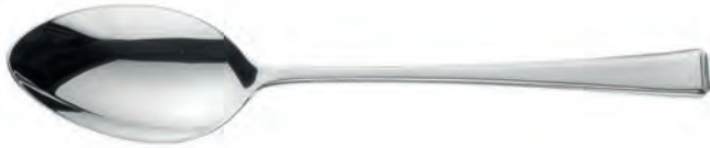
Table Server Spoon 22cm