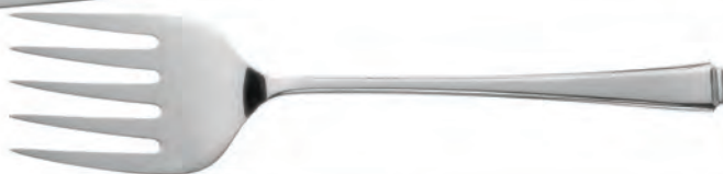
Fish Carver Fork 22cm