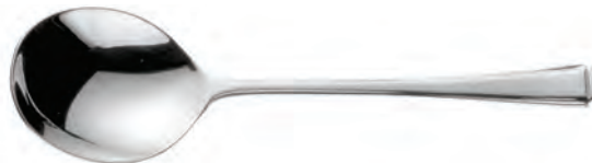
Soup Spoon 18cm