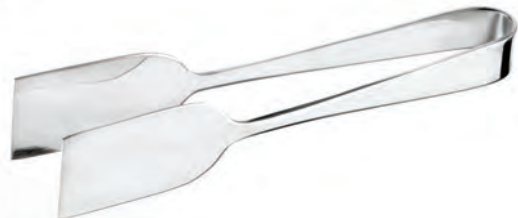
Sandwich Tongs 17cm