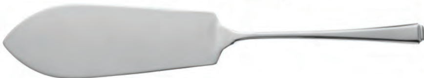
Fish Carver Knife 31cm