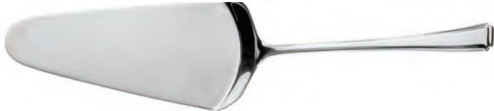
Flanged Cake Lifter 24cm