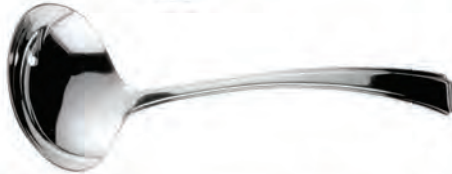
Sauce Ladle 16cm