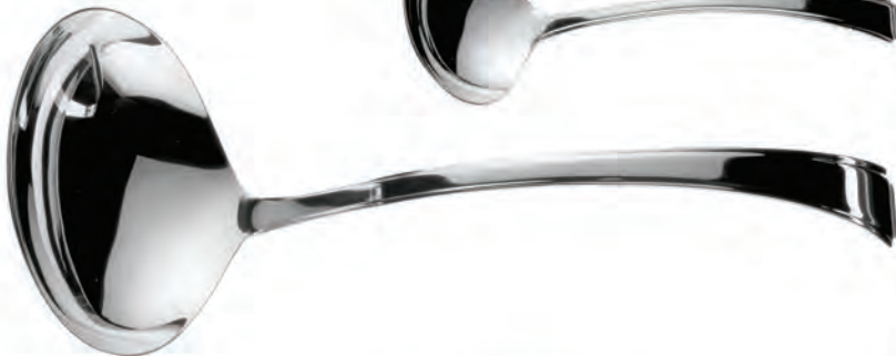
Soup Ladle 26cm