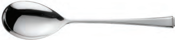
Salad Server Spoon 22.5cm