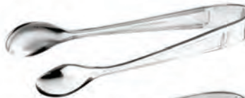
Sugar Tongs 11.5cm