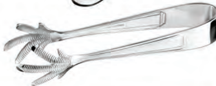
Ice Tongs 15.5cm