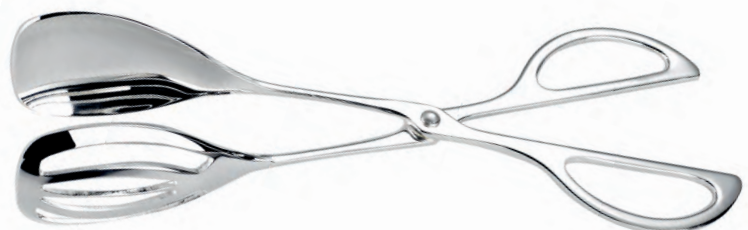
Scissor Tongs 25cm