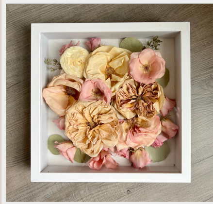
*Photo taken seven (7) months after drying process *This was an anniversary bouquet, a remake of the clients original bridal bouquet Florist: The Parcel Flower Company