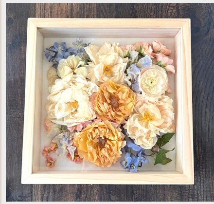
*Used only bouquet florals Florist: Willow & Brook