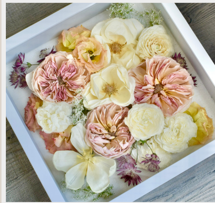
*Used only centerpieces to create frame *This frame was created from clients bridal shower floral arrangements Florist: Ohana Event Co.