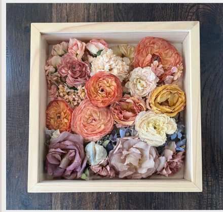
*Used the remaining florals from her bouquet and a few extras to create a full floral, ombré frame Florist: Willow & Brook