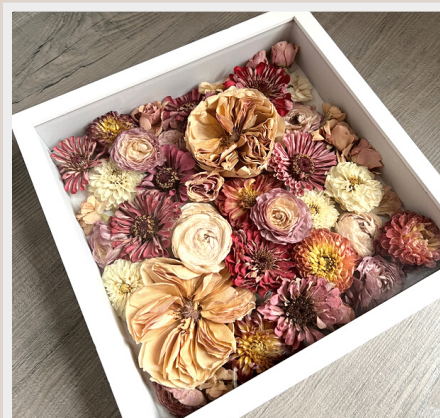
*Used only colorful florals from centerpieces to create this frame. *Photo taken 1.5 years after drying process. Florist: Flowers by Alexis