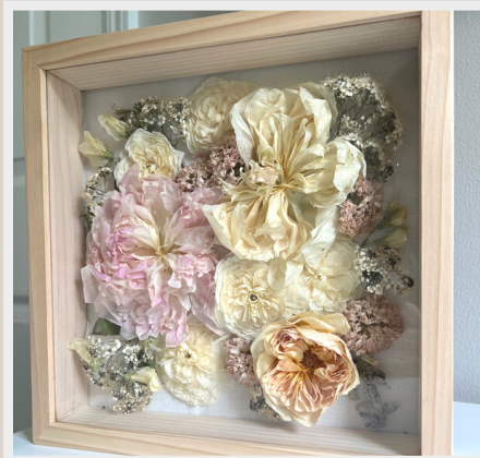
*Used only bouquet florals Florist: Three Roots Floral Design