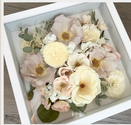
*Used additional hydrangeas from centerpieces to add more texture to the frame Florist: Petal & Paper NJ