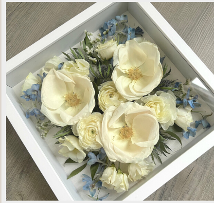
Florist: Bella Fiori Floral & Event Design