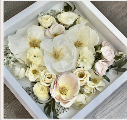
Florist: Angel Wedding Works