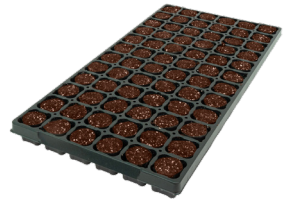
72 Count PlugTray