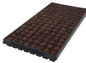
128 Count Square PlugTray