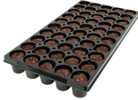
50 Count PlugTray