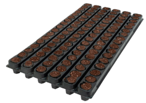
102 Count 17 x 6 PlugTray