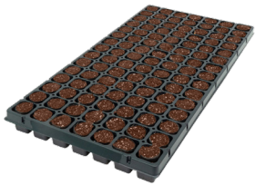
105 Count PlugTray