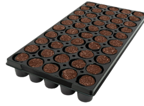
50 Count Tall PlugTray