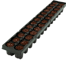
26 Count PlugStrip