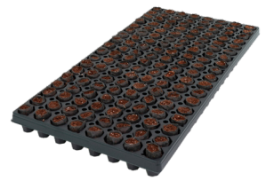
144 Count PlugTray