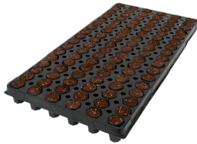
102 Count PlugTray