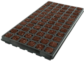
72 Count Tall PlugTray