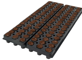
102 Count 51 x 2 PlugTray