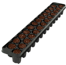
25 Count PlugStrip

If your operation would benefit from a configuration not shown here, please let us know.