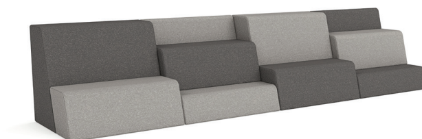
Motion Grandstand Example