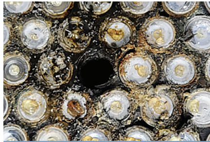
▲ Breakdown photos: not representative of trade secret test set up