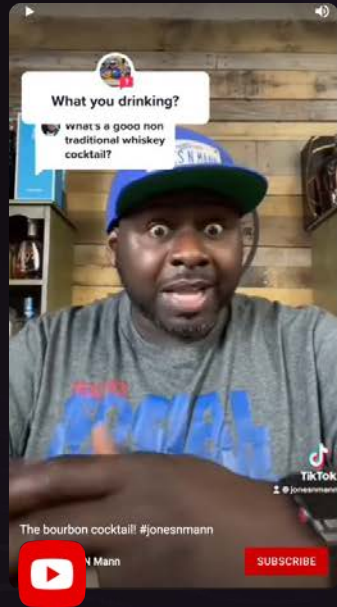
JonesNMann 40K+ subscribers

Here are just a few examples of some of our brand ambassadors doing what they do best - mixing up fun content with brands we work with here at www.CWSpirits.com !