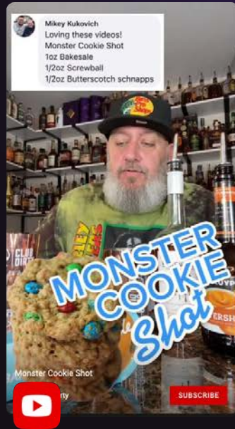
Club Dirty Over 205K+ subscribers