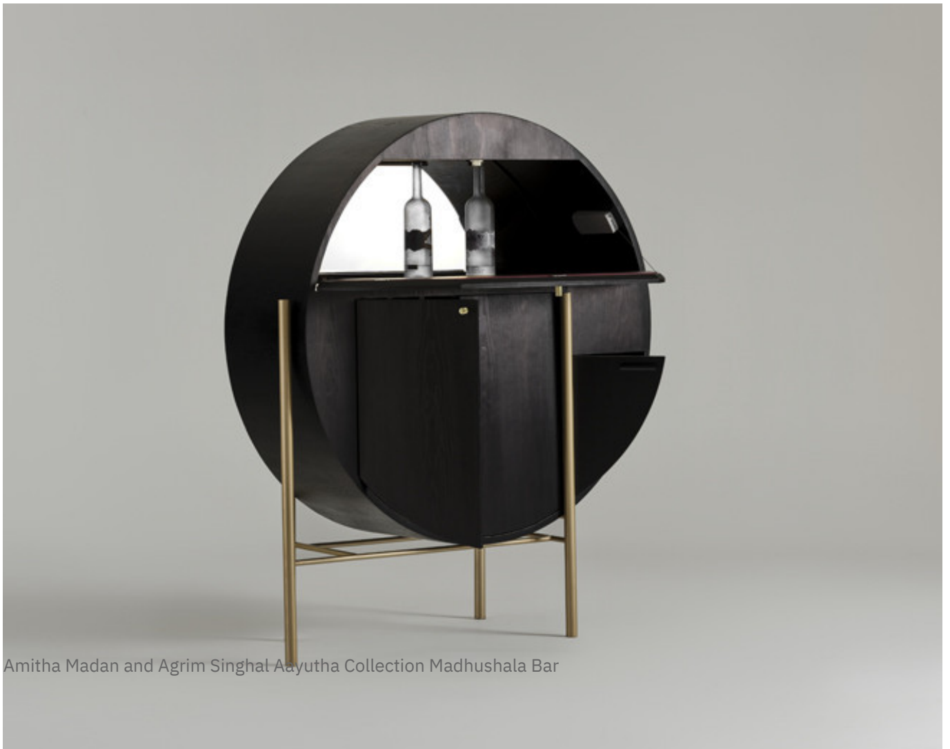
Amitha Madan and Agrim Singhal Aayutha Collection Madhushala Bar

The polished stone finish contrasts with the rough-cut natural texture of granite to elevate the senses.