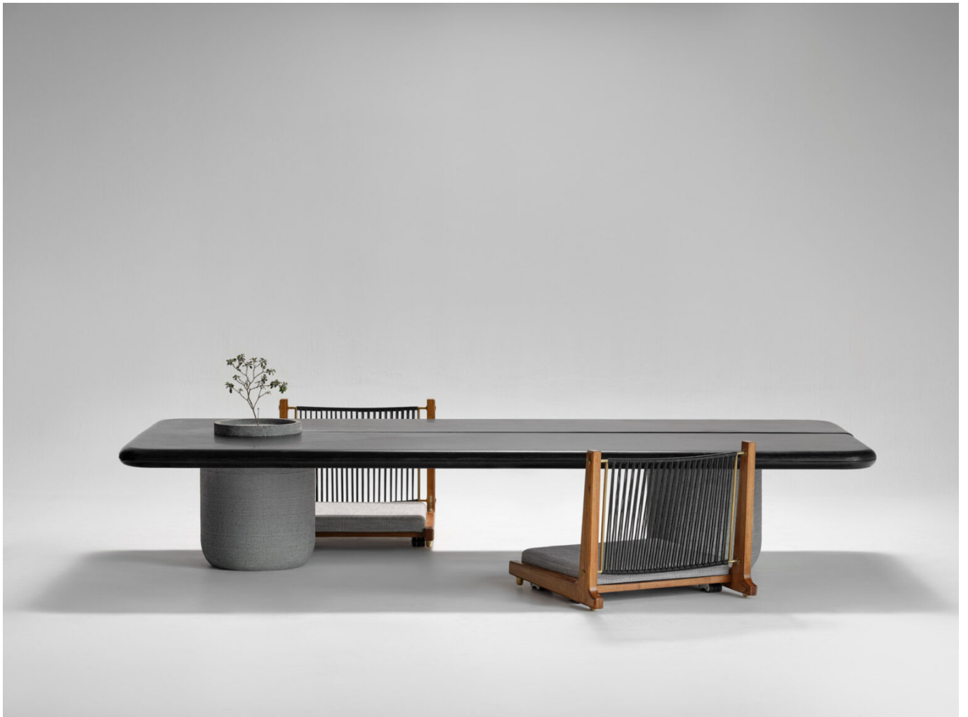
Amitha Madan and Agrim Singhal- Aayutha Suvai Dining Table