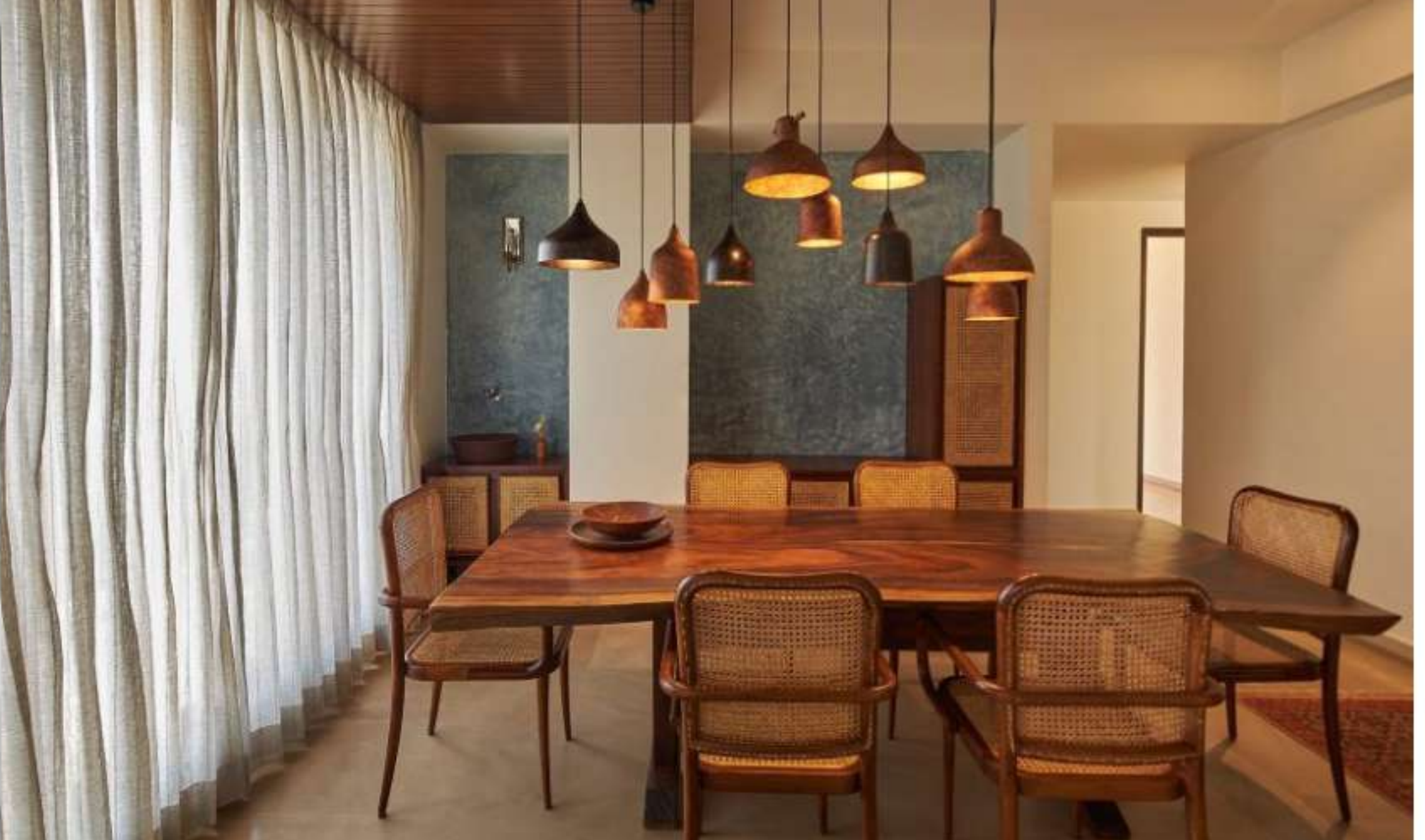
Photo Caption: The furniture in each room has been custom-made by Magari in Bangalore

Following the client’s brief of keeping things natural and organic, the Bangalore penthouse is home to a number of plants, especially in the open deck areas. Even the flooring is in-tune to the aesthetics of the space. You’ll find sandstone, kota, wood, and pigmented cement flooring in different rooms. The furniture has been custom-made by Magari in Bangalore – be it the log dining table with cane weave chairs, a low daybed, the soft sink-in sofa, or the bean bag.