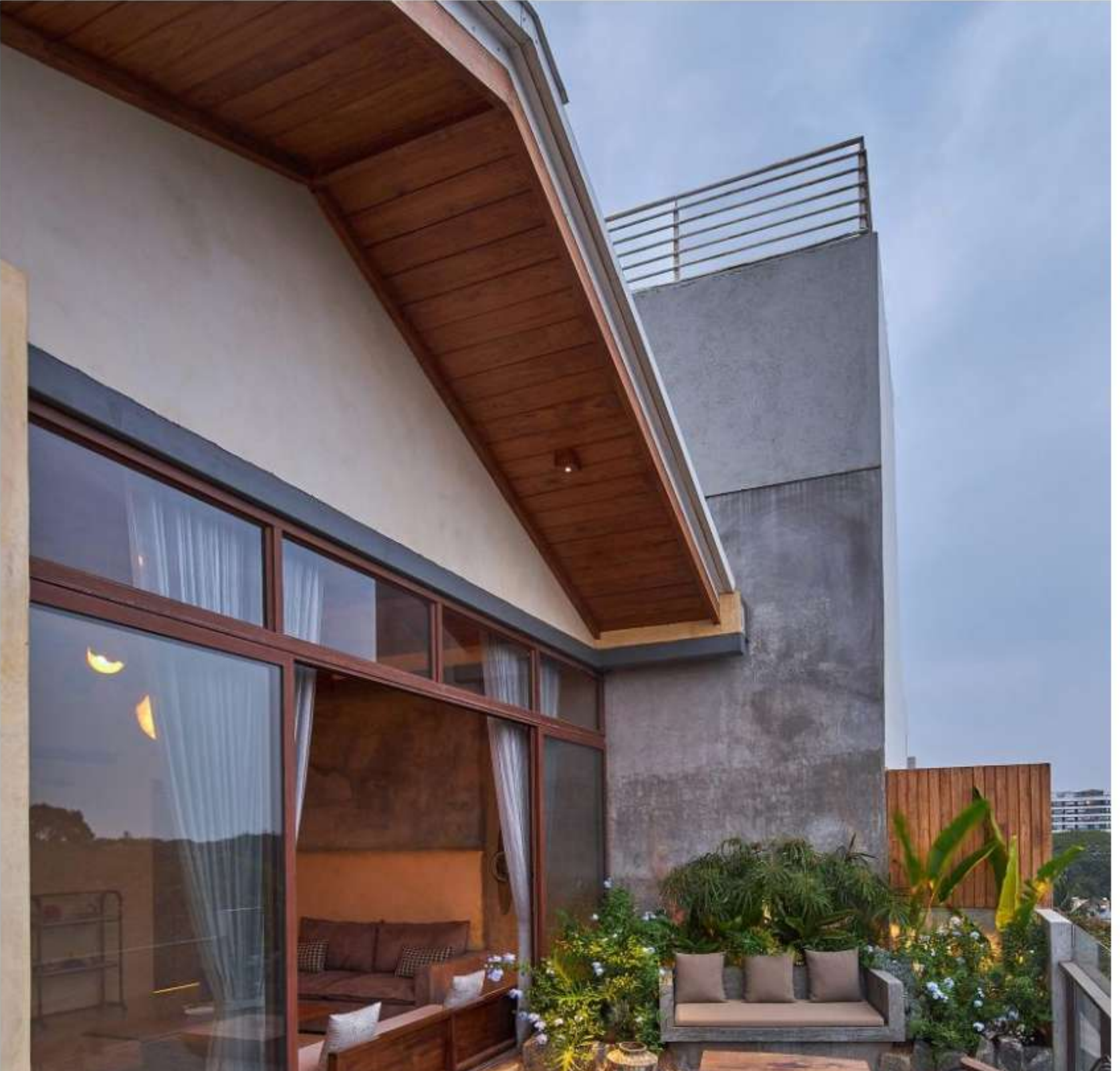
Photo Caption: There are several decks in this Bangalore penthouse

The most appealing thing about the design of this Bangalore penthouse is the seamless flow of the indoor into the outdoor, making it an apt habitat for the owners, and a space to admire by others.