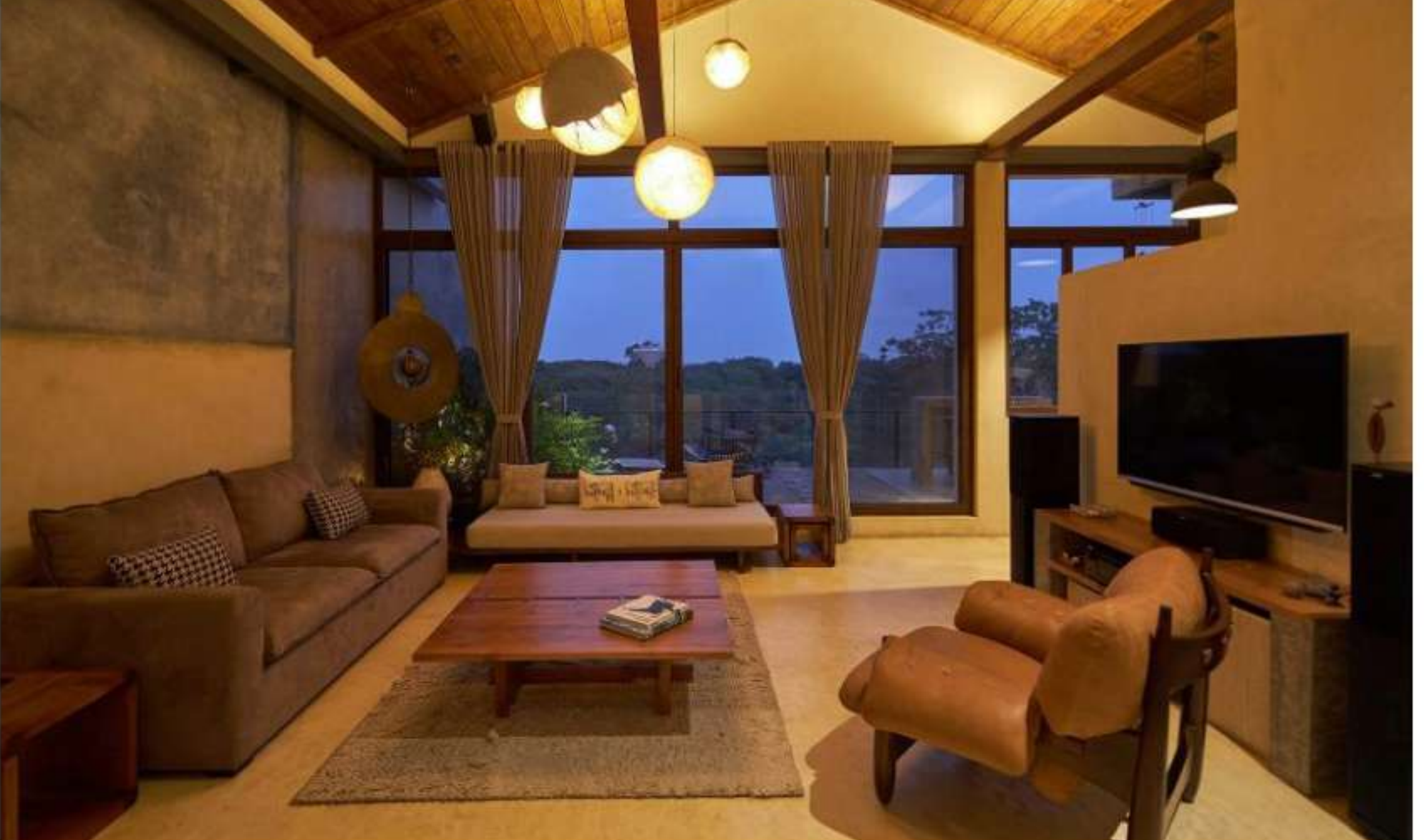
Photo Caption: All the decorative fixtures in the Bangalore penthouse have been custom designed by Treelight Design

The lighting is designed to create a warm, ambient environment with highlights on certain features like the art and furniture accents, and in some places, the fixture itself is the highlight. All these decorative fixtures have been custom designed in-house, reveals Madan. “We designed the wall lights in the living room, the light installation above the dining area and the yin and yang installation in the upper level living room,” she says.