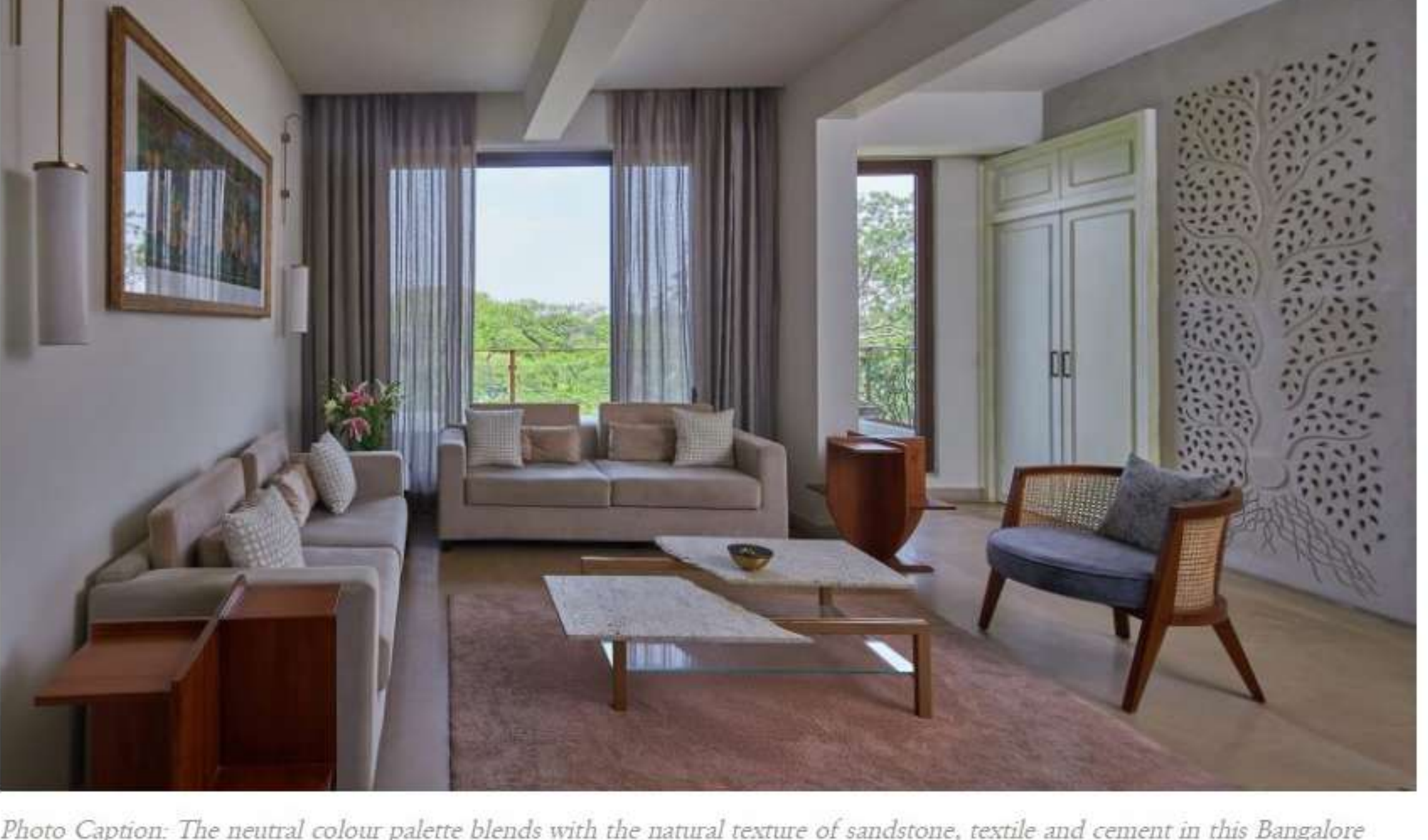
Photo Caption: The neutral colour palette blends with the natural texture of sandstone, textile and cement in this Bangalore penthouse

“The client wanted to have a space that reflected serenity and had a natural flow through the house. They wanted it be a place of tranquility and quiet, a contrast to its surroundings,” says Madan about the family’s brief to her.