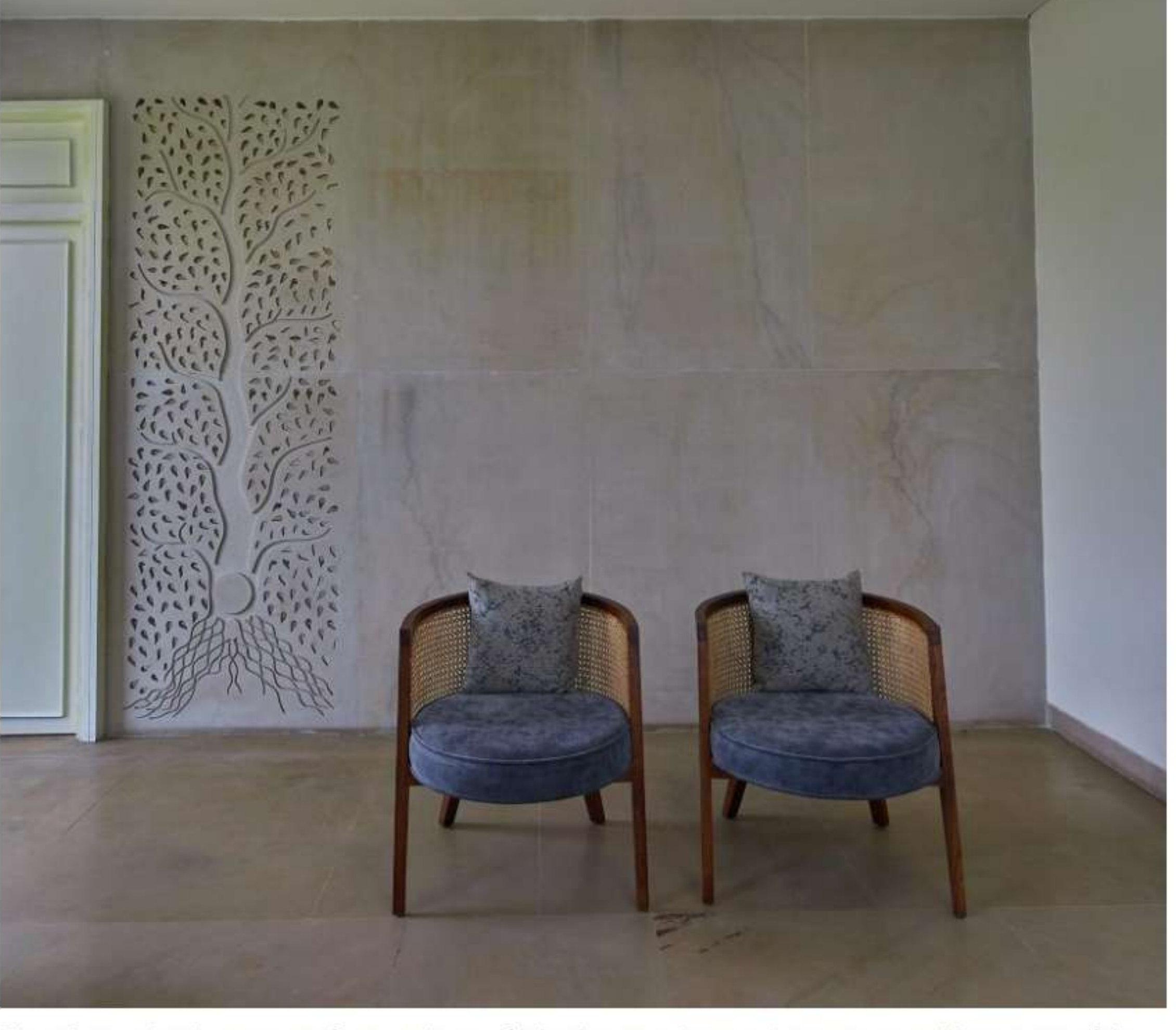
Photo Caption: Another interesting feature is the tree of light jali partition between the prayer room and living section of this Bangalore penthouse

The main decor element in the house is the vintage astro-globe sculpture in the living area on the upper level, which is suspended from the ceiling and has been sourced from Jew Town in Fort Kochi. Another interesting feature is the tree of light jali partition between the prayer (puja) room and living section. The intricate detailing of leaf motifs has a wonderful play of patterns in the living area thanks to the prayer room lights being on throughout the day.