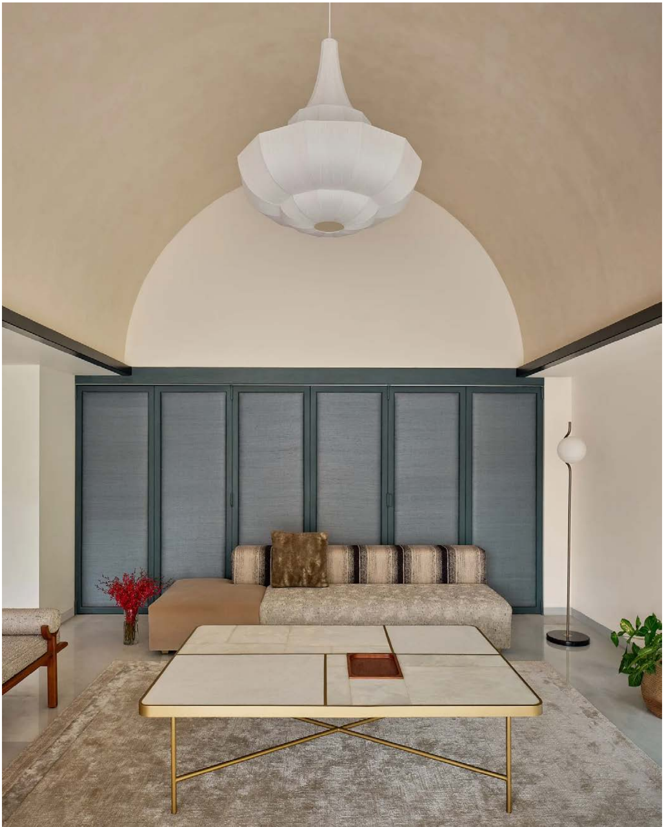
This low seating is part of the living room