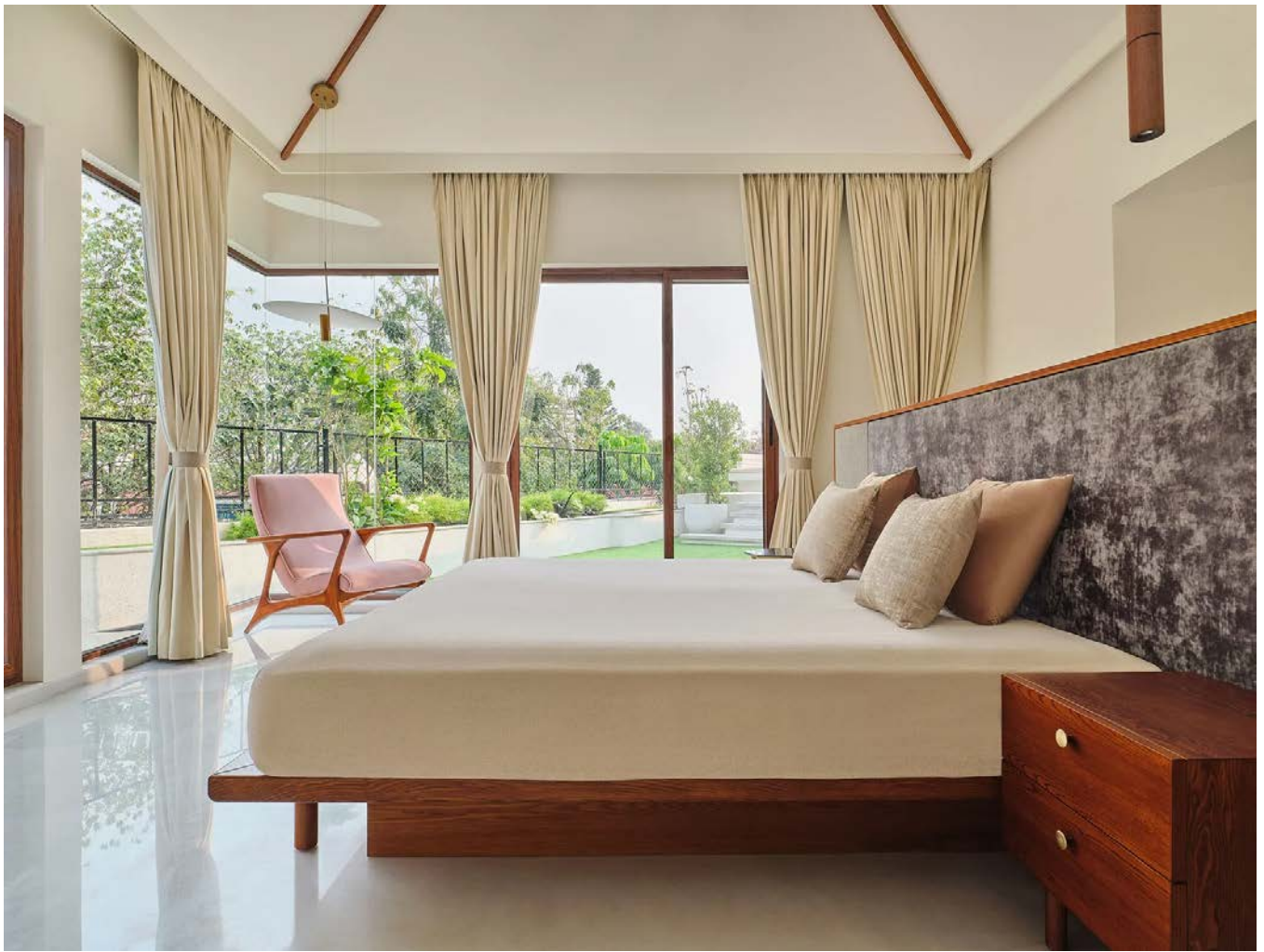
The master bedroom has been designed like an observatory