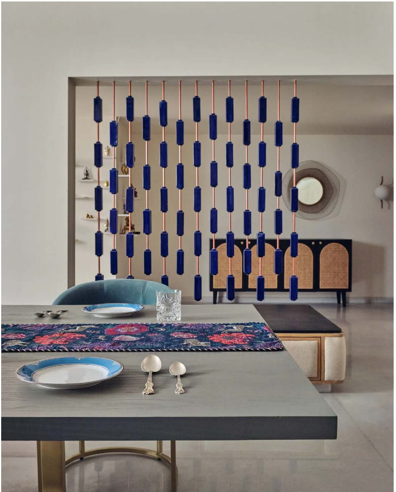
The beautiful pottery serves as a subtle partition between spaces