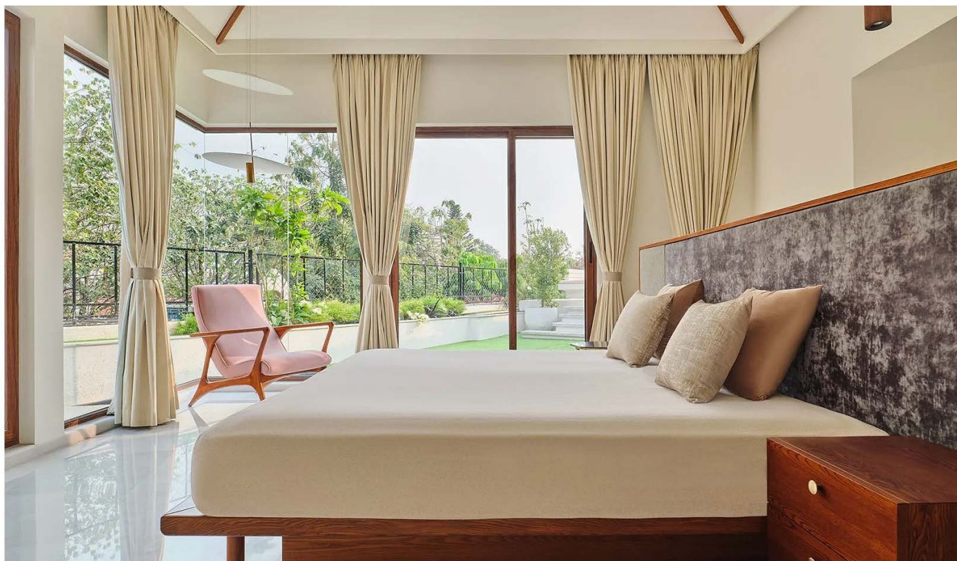
Take a tour inside this Bangalore home

Natural light and breeze have taken residence in this penthouse in Bangalore, designed by Treelight Design. The home spread over 5,200-square-feet was created to channel a sense of serenity, away from the hustle-bustle of the city. "The tropical penthouse, inspired by nature