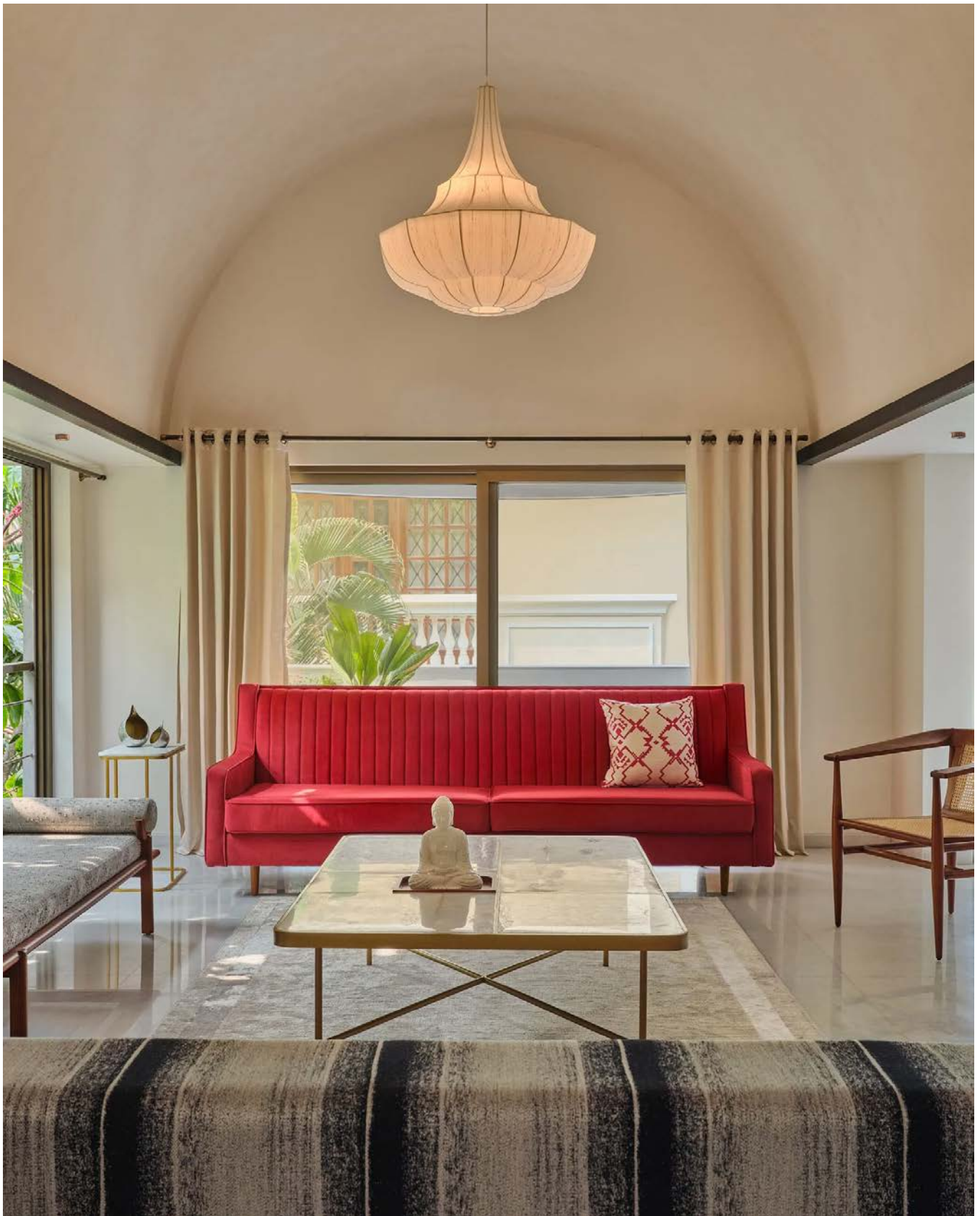
The vaulted ceiling gives the room a grand vibe