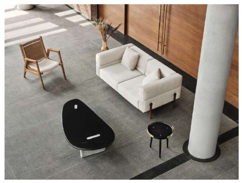
Aaram armchair, Mannai centre-table, and Thunai side tables

the Tamil script holds a steady and strong influence across Aayutha's graceful pieces from the etching on the surface of its dining tables, to the brass inlays on the side tables. "As the triple dotted letter accentuates the script, so does it accentuate the aesthetic of this collection," thereby ensuring a singular theme uniting every exquisite element and infusing harmony into the space it occupies. The three-legged Thunai side tables, for one, can be seen sporting a table surface that echoes the triple-dotted Aayutha letter.