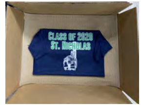
2 colour Direct-To-Garment Class of 2020 Grad T-Shirt (in box)