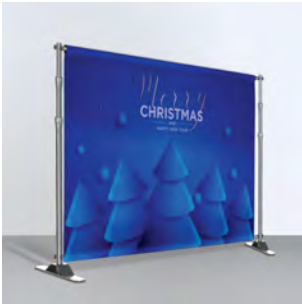
Media Wall Backdrop 8x8 feet