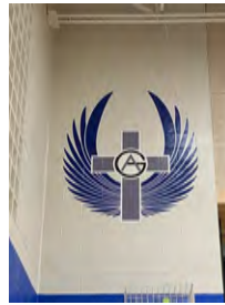
Gymnasium Vinyl Wall