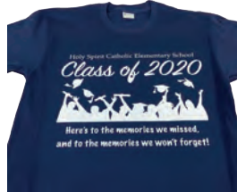
1 colour Direct-To-Garment Class of 2020 Grad T-Shirt