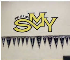
Gymnasium Vinyl Wall