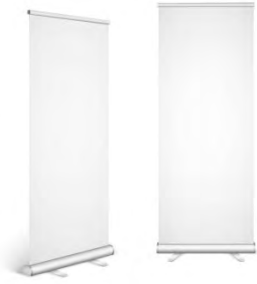
Pull-Up Banner Stand

Large Format Display Solutions can be used for both indoor and outdoor applications. Whether you are welcoming guests to the school, or directing them with signage and flags, you can be sure to catch their attention with the any of the available options!