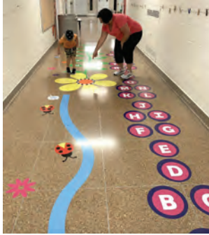
Sensory Path in Hallway

Our 3M Vinyl is fully warranty protected!