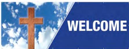
Outdoor Vinyl Banner with Grommets