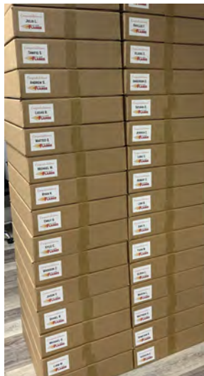
Stack of Completed Graduation Kit Boxes