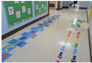
Sensory Path in Hallway