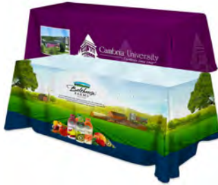
Dye Sublimated Tablecloths