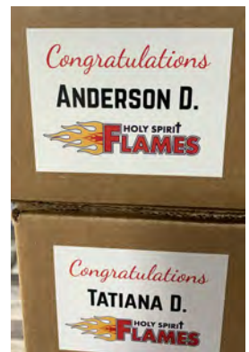
Graduation Kit Box Labels (Custom School Branded)