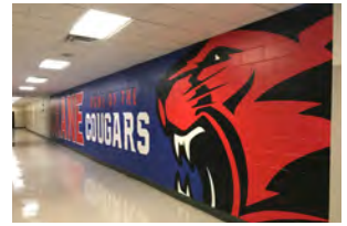
Logo Branded Vinyl Wall Wrap