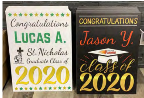
Full Colour Lawn Signs (with H-Stand included) Single Sided or Double Sided (fits inside the box!)