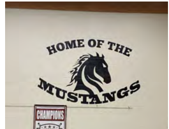
Gymnasium Vinyl Wall

287 Deerhurst Drive, Unit 2A, Brampton, ON, L6T5K3