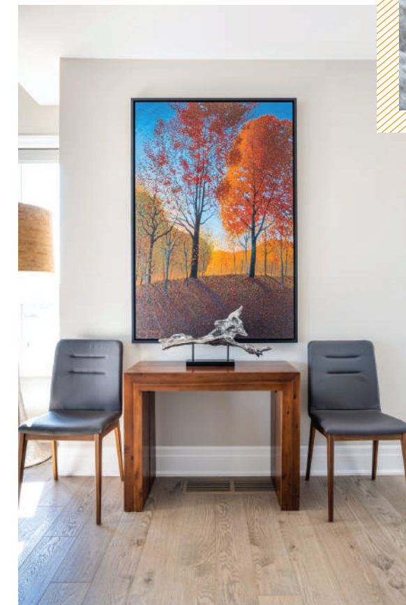
LEFT: In the front foyer, Road Side Maples by Mark Berens was purchased from Brights Gallery and hangs over a contemporary solid-wood console table. Flooring throughout the home is Apollo Vintage Solid Sawn, Sculpted UVF white oak. ABOVE: Chantico Fireplace Gallery installed the Bay Peninsula fireplace surrounded by Bluette Matte porcelain marble from the Zabrin Collection. The area rug is from W Studio Artistic Carpets. RIGHT: With three floors of living space, an elevator is a thoughtful and practical addition. OPPOSITE: All lighting and fans for the home were sourced through Georgian Design Centre. Window coverings on the main floor are Hunter Douglas Banded PowerView shades from Salnek’s Custom Window Treatments. Many of the furniture pieces throughout the room were sourced through Aboda Decor. The foyer runner matches the area rug in the living room.