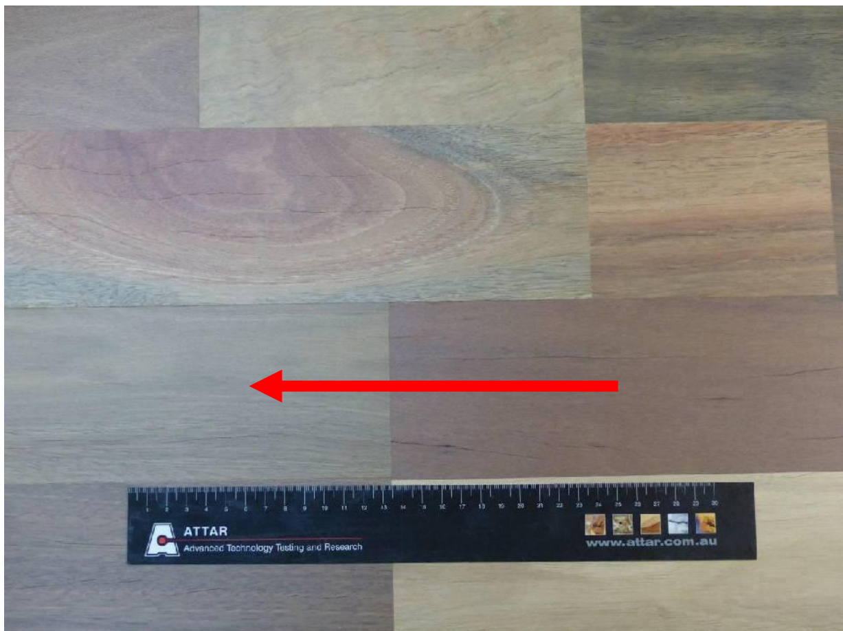
Figure 1: Loba 2k Duo R10 Antislip on Spotted Gum (1x Easy Prime 2x 2k Duo Anti Slip). Arrow indicates direction of test.