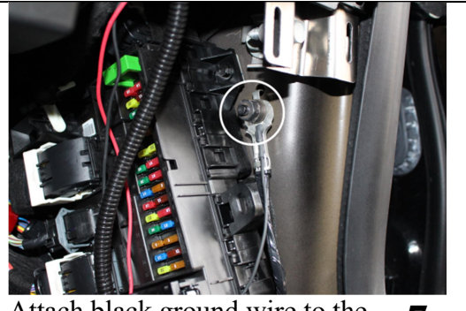
Attach black ground wire to the 13mm bolt circled above. 7