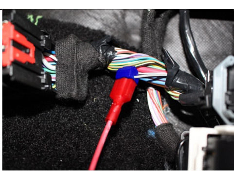
Plug red power extension wire into the wire tap.