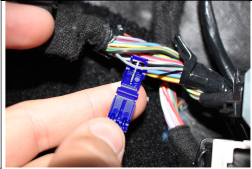
Slide the wire specified into place 5 and close wire tap.