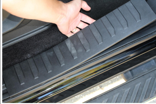
Remove passenger side door sill plate carefully. 2