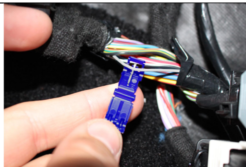
Slide the wire specified into place and close wire tap. 5