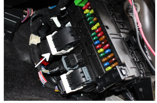
Press tab while sliding bar to the side to unplug connector. 4