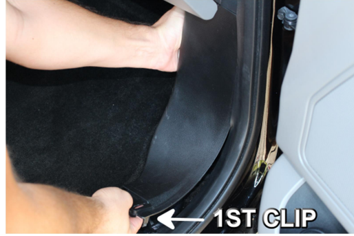
Remove kick panel. First pull upward, then backward. 3