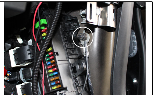
Attach black ground wire to the 13mm bolt circled above. 7