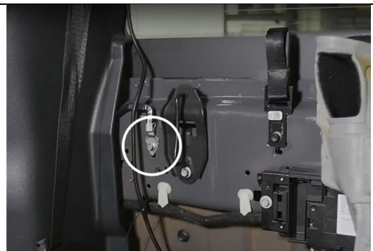
Attach black ground wire to the 8mm stud circled above. 5