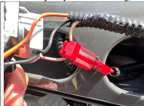
Plug red power extension wire into the wire tap. 4