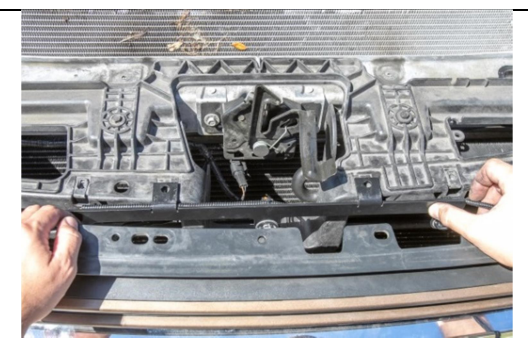
Slide light bar into place as shown.