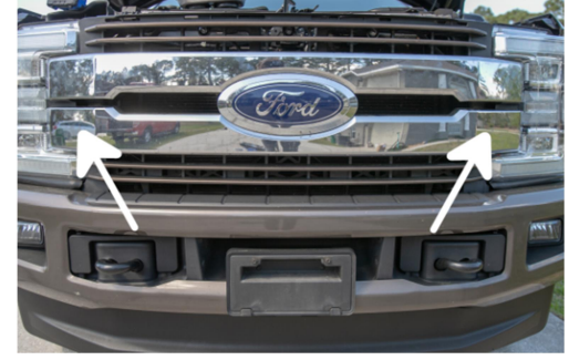
Clips hold grille in place – pull outward to un-clip each side.