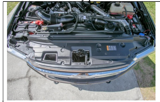
Remove radiator cover. Save push pins for re-install later.