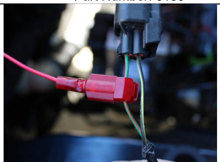
Plug red wire into the wire tap as shown above.