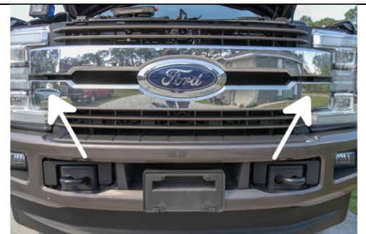
Clips hold grille in place – pull outward to un-clip each side. 3