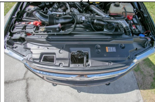
Remove radiator cover. Save push pins for re-install later. 1