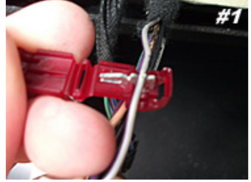
Slide wire into place and close wire tap firmly.