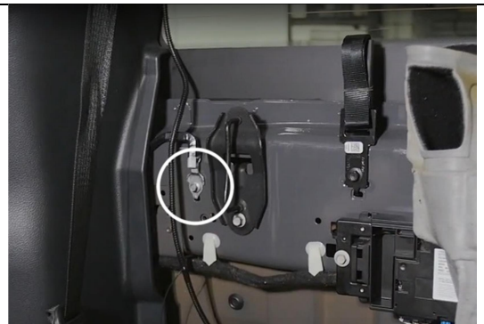
Attach black ground wire to the 8mm stud circled above. 5