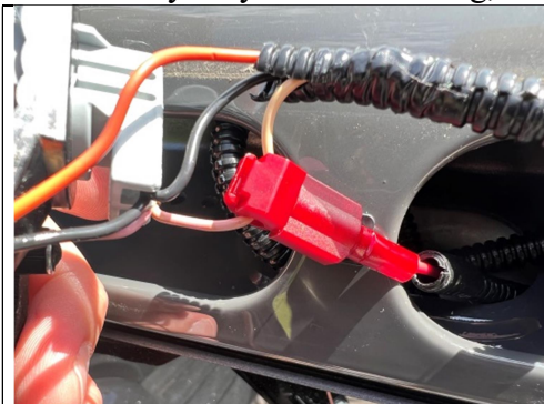
Plug red power extension wire into the wire tap. 4