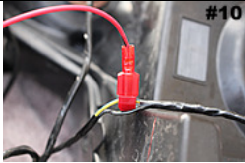
Plug correct wire into the wire tap as indicated above.