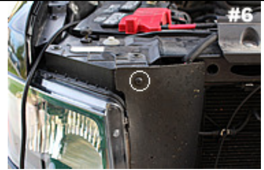
Remove screw with phillips screwdriver.