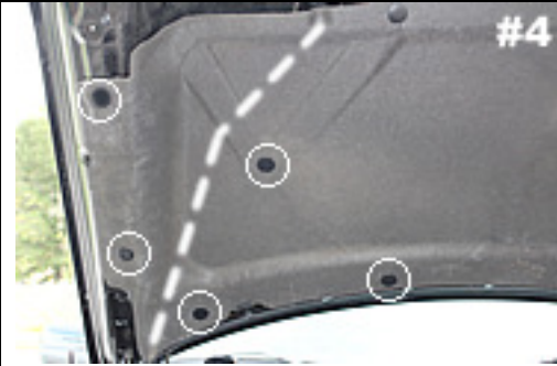
Remove circled push pins and route wiring behind insulation along line.