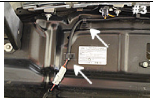
Secure wiring behind the grille with included adhesive backed pads.