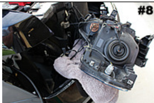
Lay headlight on soft surface or unplug all connections and remove.