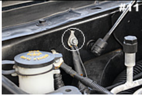
Attach the ground wire to the bolt behind the washer fluid reservoir.