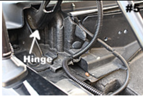
Use supplied zip ties to secure wiring at hood base – do not zip tie to hinge.