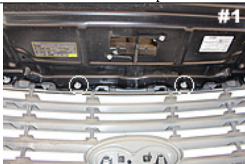
Remove 10mm nuts on backside of grille above the Ford emblem.