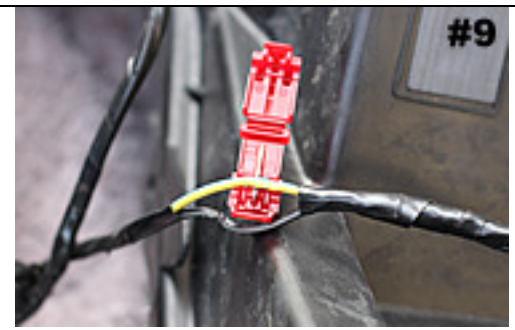
Slide wire into place and close wire tap completely.