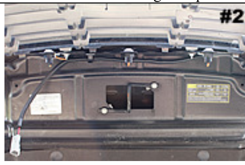
Position bracket and tighten the 10mm nuts.