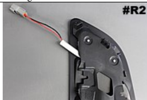
Shown is the LED lamp partially installed in the front slot of extractor.