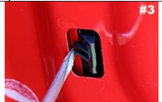
Use a flat head screwdriver to carefully un-clip heat extractors.