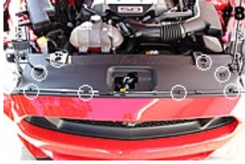
Remove black panel shown. Save 8 retaining pins for re-install later.