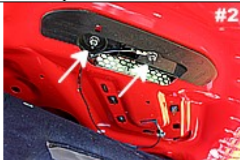
Remove the 2 – 9mm nuts and black retaining plate that secure extractor.