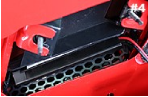
Shown is how the lamp/ bracket will look installed on the heat extractor.