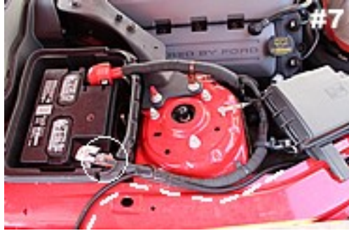
Attach ring terminal to bolt circled above. Re-tighten the bolt.