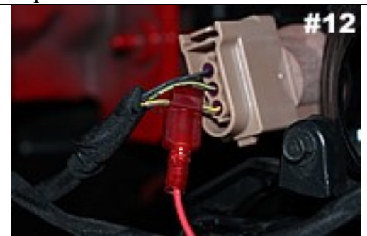
Plug red wire into the wire tap as shown.