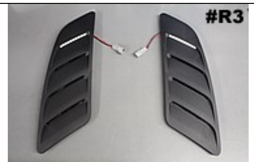
Shown are the lamps once installed. Connectors should be on the inside.