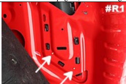
Remove the 2 – T10 Torx screws that help secure each heat extractor.