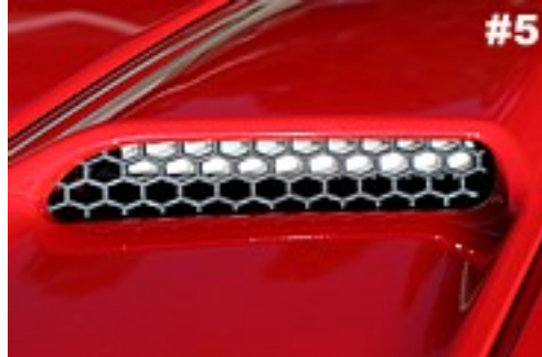
Shown is another view of the lamp after it has been installed.