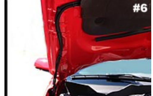
Use zip ties to secure wiring at hood base – follow washer fluid hose.

At this point you want to have a very good idea of where the lamp needs to be placed. In the following steps we will prep the surface and apply an adhesion promotor to ensure a strong bond. Once the bracket is attached, it will be difficult to move so you want to be sure of the placement.