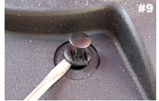
Pry up on center part of pin first. Then pry out entire retainer pin.