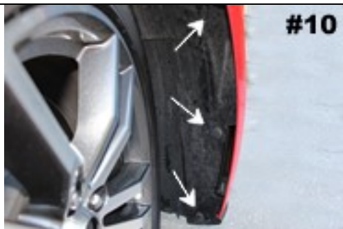
Shown are 3 of the 5 push pins you must remove in the wheel well.