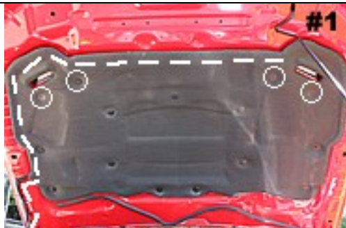
Remove 4 circled pins. Route wiring along dashed line.