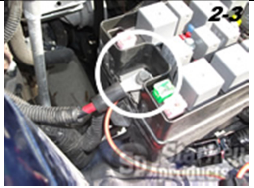
Line up the power cable with the orange wire so that the cover closes.