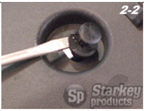
Pry up on center part of pin first. Then pry out entire retaining pin.

Remove black panel shown. Save 6 retaining pins for re-install later.