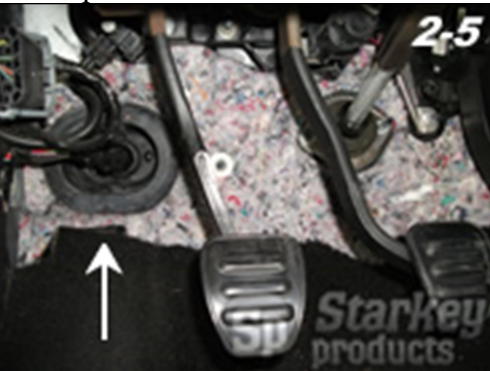
SD STORMER products