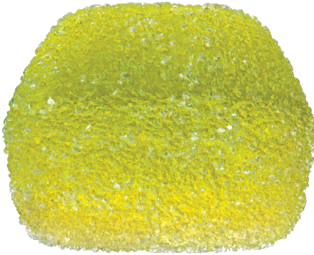
1700MG FULL SPECTRUM BITES 10 GUMMIES - 170MG PER GUMMY (CBD, Δ9THC, CBG, CBN, CBC)