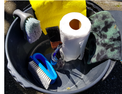
Bucket, soft cloth, paper towels, scrubbing brush