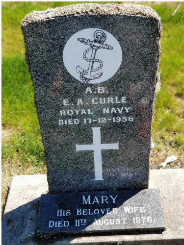
Granite Military Grave with Granite Plaque for Wife

There are a range of different types of graves that require various cleaning or restoration methods.