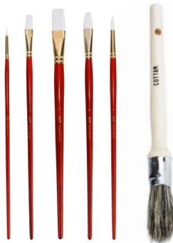
Various paint brushes