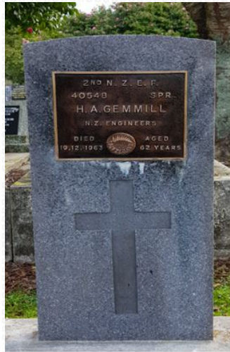
Bronze Plaque and Concrete Military Grave