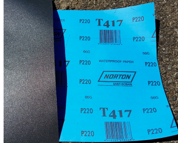
220 grit sandpaper