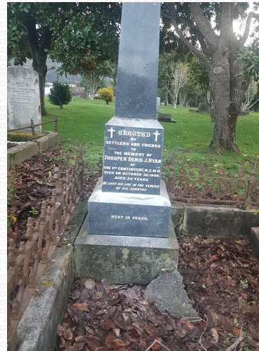
Granite Memorial Cenotaph