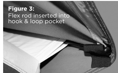
Figure 3: Flex rod inserted into hook & loop pocket