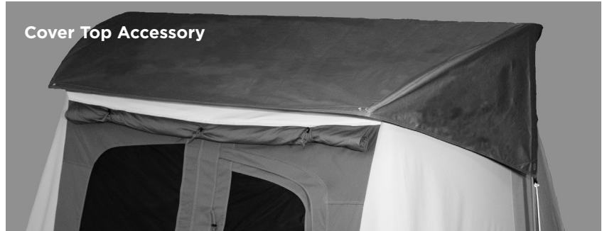
Cover Top Accessory