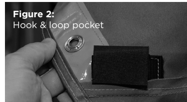
Figure 2: Hook & loop pocket