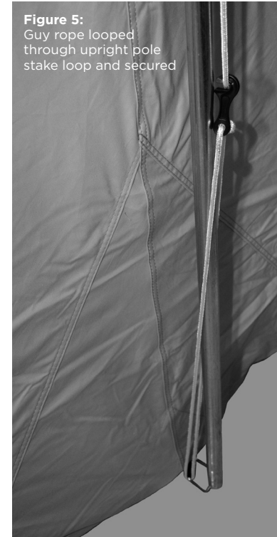
Figure 5: Guy rope looped through upright pole stake loop and secured