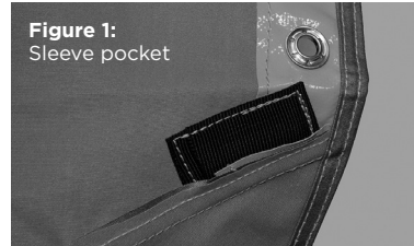
Figure 1: Sleeve pocket