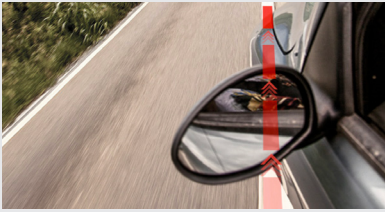
LDWS Lane Departure Warning System

The IROAD FX series is equipped with the Road Safety Warning System that provides audio and visual alerts for Lane Departure (LDWS), Front Collision (FCWS) and Front Vehicle Departure (FVDW). It detects road markings and gives voice warnings to the drivers if the vehicle begins to stray from its lane or when it is at risk of an imminent crash.