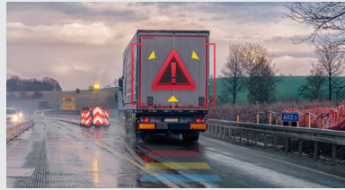
FCWS Forward Collision Warning System