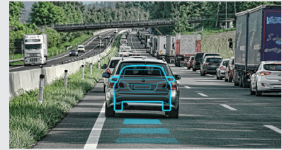
FVDW Front Vehicle Departure Warning