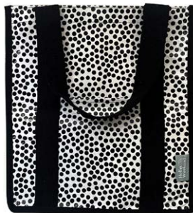
Speckle Daily Bag