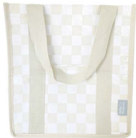
Checkerboard Daily Bag