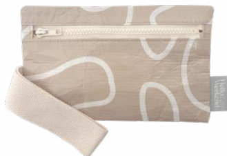
Latte Phone Pouch