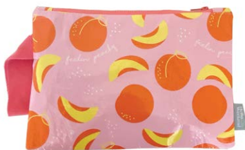
Feelin' Peachy Pouch