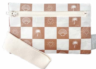
Icons Phone Pouch