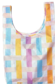
Summer Splice Shopper