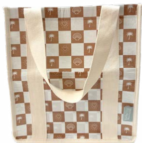
Icons Daily Bag