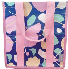
Garden Party Daily Bag