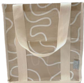
Latte Daily Bag