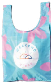
Weekend Vibes Shopper