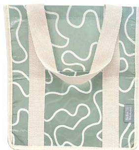
Sage Daily Bag