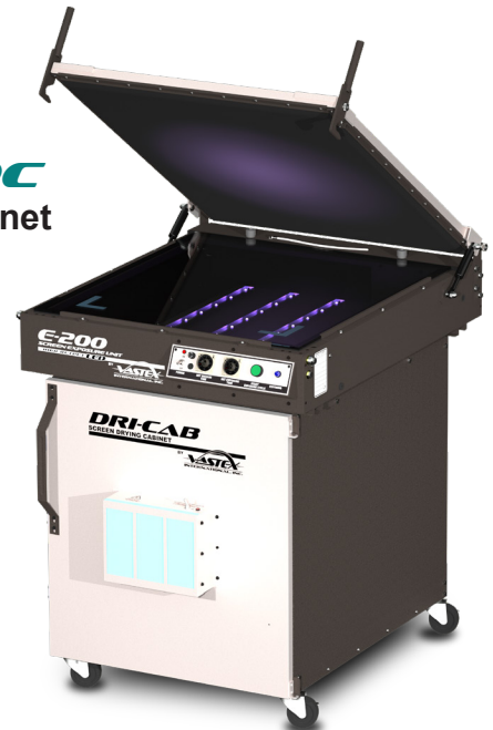
E2-2128-VDC E-200 w/ Drying cabinet