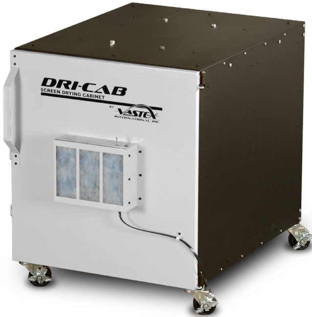
VDC-2331 Holds (10) 23" X 31" (58 X 79cm) screens

Dry your screens securely in the 10 screen Dri-Cab. Powered fan with filtered air flow can have your screens ready for exposure, in as little as 60 MINUTES!**