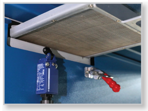
Easy-to-reach filters, belt replacement & lubrication points