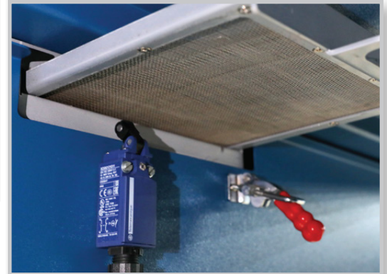
Easy-to-reach filters, belt replacement & lubrication points