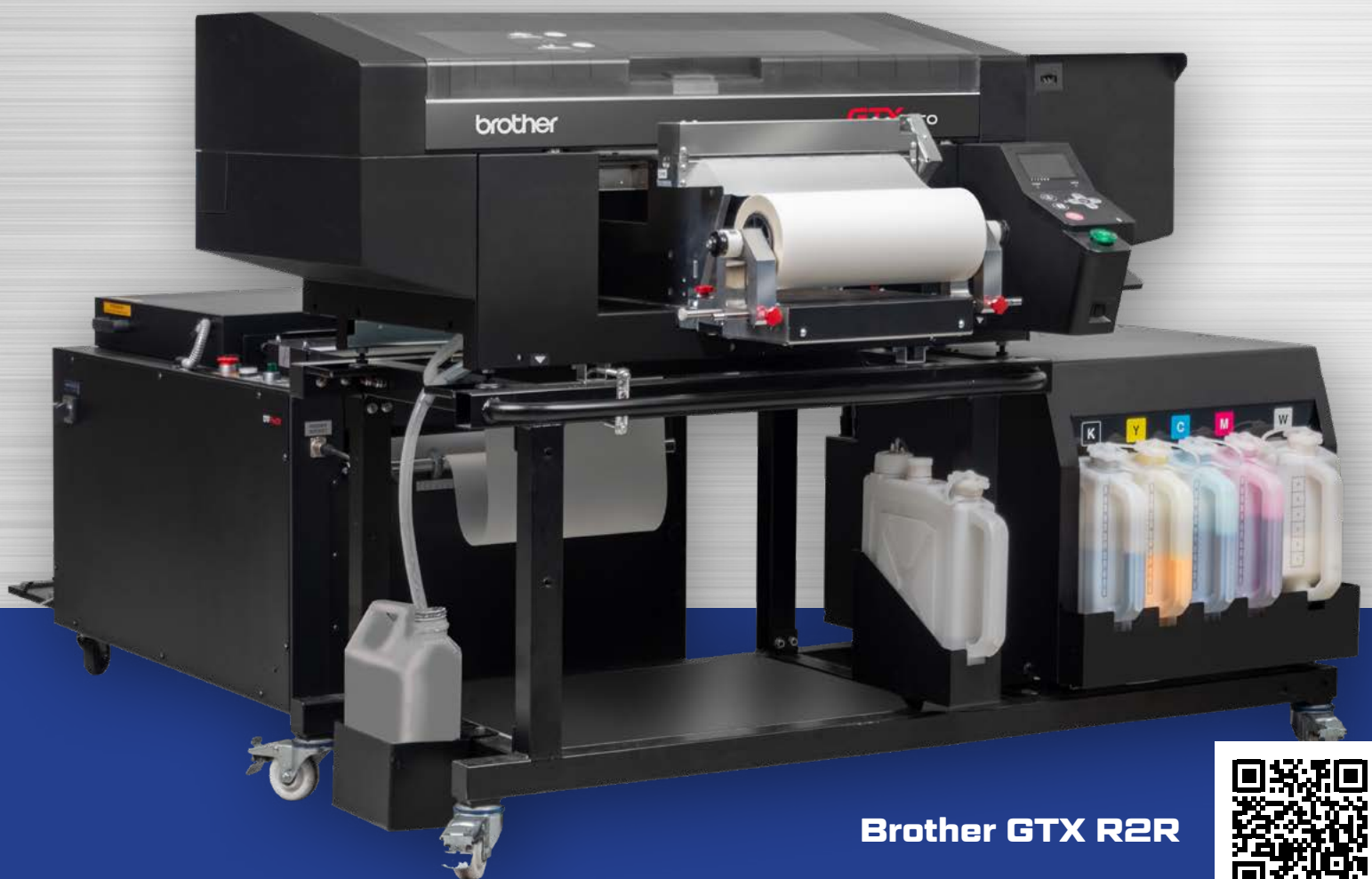
Brother GTX R2R