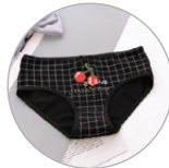
Other Specialty Items