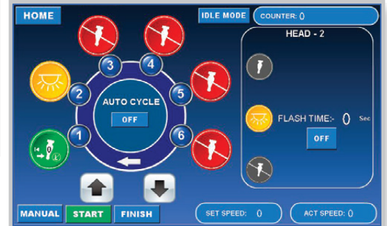
Digital touchscreen control panel loaded with a wide range of smart programs to assist operators in production