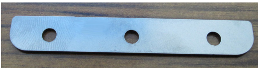
Figure 1A Spacer

Some brackets also come with a little spacer. See Figure 1A. This spacer is to be inserted between the hoop and the bracket so that it holds the bracket a little higher.