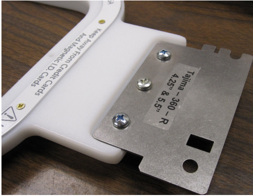
Figure 2 4.25" or 5.5" mounting

The way the screws go through is different between the small sizes of Mighty Hoops and the large sizes. The small hoops, like 4.25" or 5.5", the nuts will go on the underside of the hoop. The large hoops, like 10x10" or 11x13" the nuts will go on the top side. The small hoops also have a screw that has a normal round head. The large hoops have a screw that has a countersink flat head since it needs to be flush on the underside of the hoop. See Figure 2 and Figure 3.