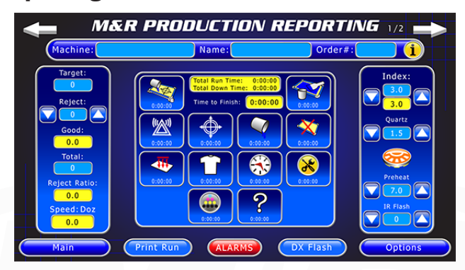
MPR interface is included on the press HMI