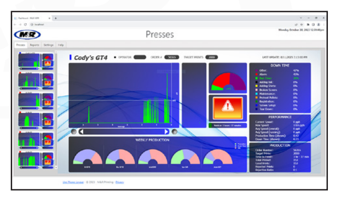
Press detail screen shows causes for downtime with percentages

The M&R Management Production Reporting (MPR) software enables productivity monitoring of multiple M&R presses across a computer network via a web browser. Productivity is tracked with results displayed graphically through the system dashboard with downloadable equipment efficiency reports. Users can compare performance from press to press, operator to operator, and against industry or company expectations.