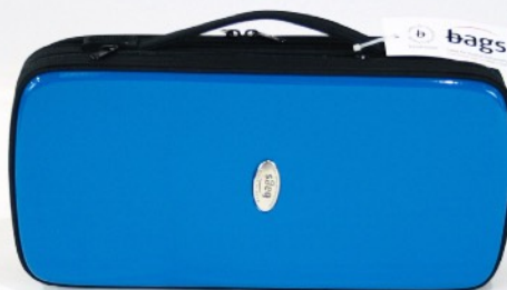
AZUL - BLUE - BLEU - BLAU