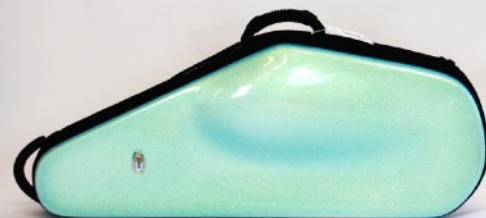
AZUL/VERDE - BLUE/GREEN BLEU/VERT - BLAU/GRÜN