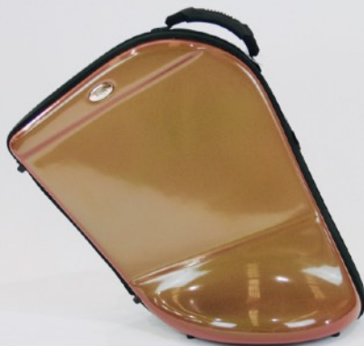
TABACO - TOBACCO TABAC - TABAK