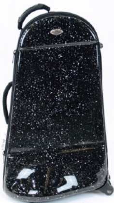
FUSIÓN NEGRO - BLACK FUSION FUSION NOIR - SCHWARZ FUSION