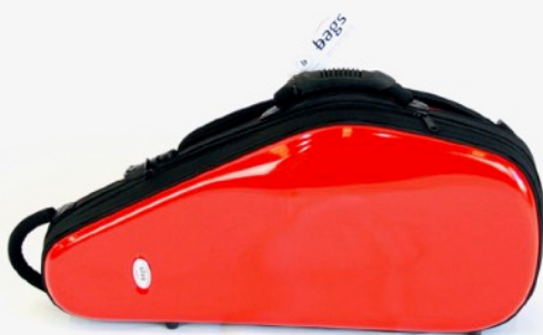
ROJO - RED - ROUGE - ROT