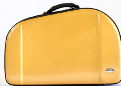
ORO - GOLD - OR - GOLD