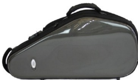
GRAFITO - GRAPHITE GRAPHIT