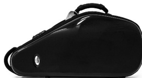
NEGRO - BLACK NOIR - SCHWARZ