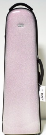
ROSA - PINK - ROSE