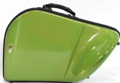
VERDE - GREEN VERT - GRÜN