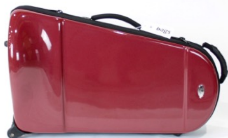
ROJO - RED - ROUGE - ROT