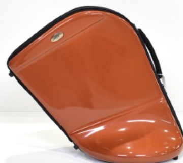
COBRE - COPPER CUIVRE - KUPFER