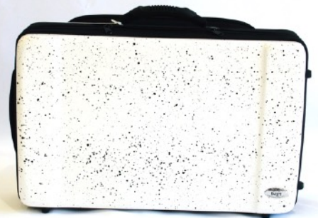
FUSIÓN BLANCO - WHITE FUSION FUSION BLANC - WEISS FUSION