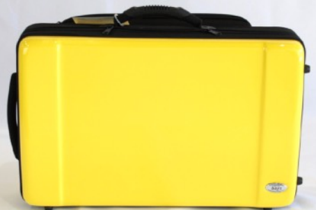
AMARILLO - YELLOW JAUNE - GELB