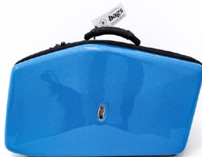
AZUL - BLUE BLEU - BLAU