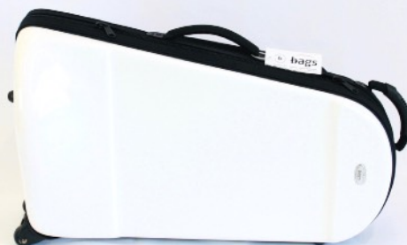
BLANCO - WHITE BLANC - WEISS