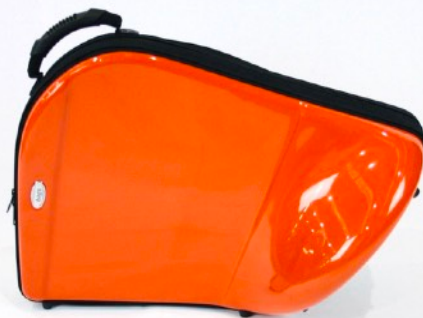
NARANJA - ORANGE