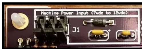
Figure 3 - Populated Machine Power Input Section

The Machine Power Input is located at the top left side of the CSSC. This connection has a 3 pin .156 inch header (J1). The machine input power can be hooked up to any DC voltage between 7vdc and 12vdc. The pinouts are represented in Figure 3 to the right. Pin 1 is the KEY, which is not connected to anything, Pin 2 is the Ground of your machine power source, and Pin 3 is the Positive input of your machine power source. We have tested the CSSC on unregulated 12v circuits that bounce to 14vdc with no issues at all, but it is recommended not to exceed 14vdc as you may cause damage to the CSSC's internal voltage regulator. This power supply voltage should switch on and off with the power switch of the Arcade/Pinball machine or be hooked up to an ignition source in automotive applications.