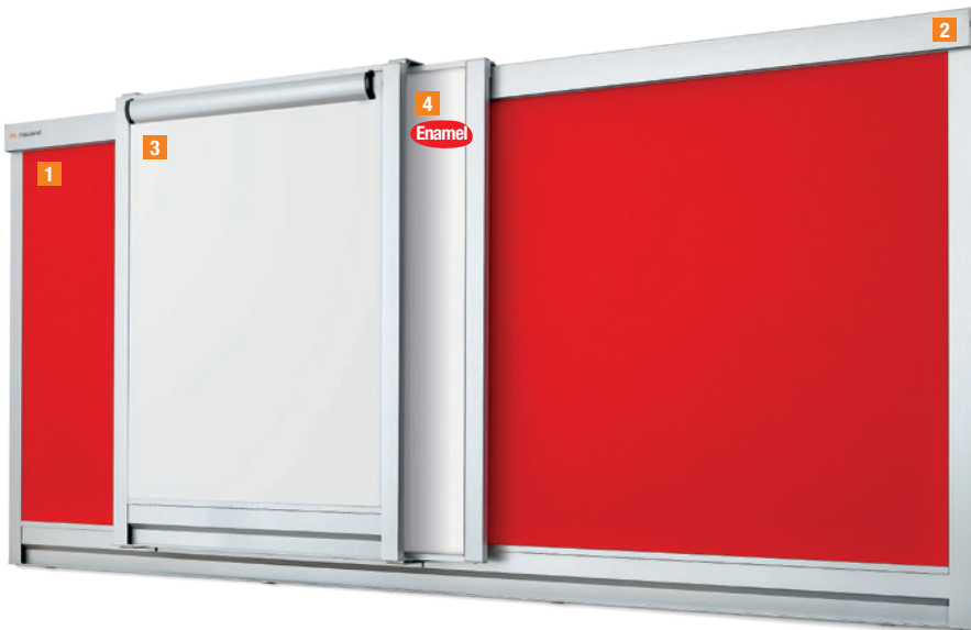
Fig.: LW-S basic element with additional rail and sliding panels in two levels