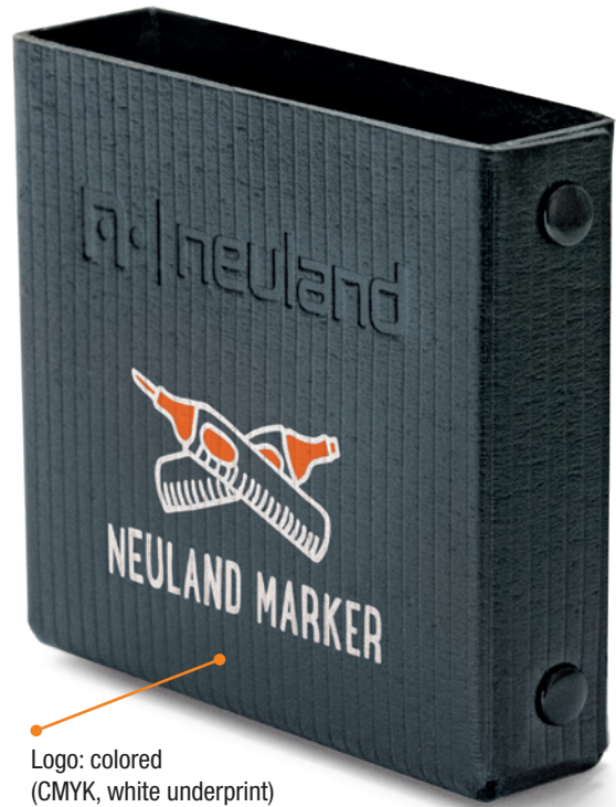
Logo: colored (CMYK, white underprint)

This is what your MagneticBox might look like: