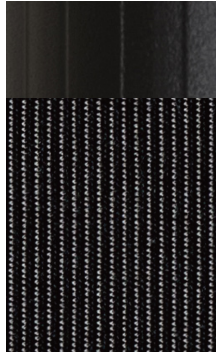
BLACK FRAME CANVAS COAL