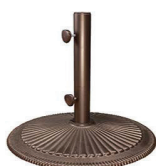
CLASSIC 50 LB