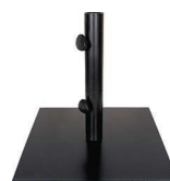
FLAT STEEL 35 LB / 70 LB