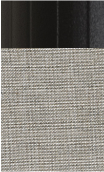
BLACK FRAME CAST SILVER