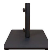
ROLLING STEEL 120 LB