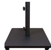
ROLLING STEEL 120 LB