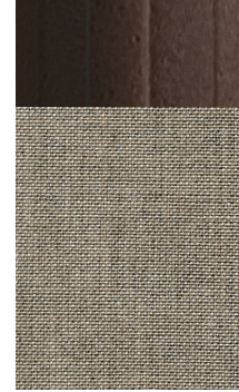
BRONZE FRAME CAST ASH

ACRYLIC FABRICS MANUFACTURED BY SUNBRELLA & OTHERS WITH A 5 YEAR WARRANTY AGAINST FADING.