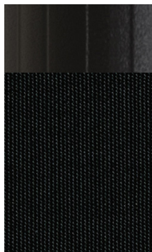
BLACK FRAME BLACK